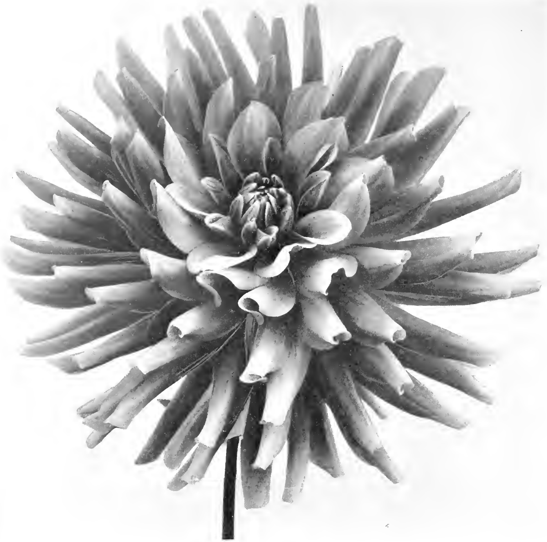
LAURA ENTREKIN Hybrid Cactus. Size 8" x 4". The photograph above shows the wonderful formation and splendid stem of this new acquisition. The color is deep, lively rose pink, reflex pure rose pink. A strong vigorous grower, free bloomer, and is borne on long stiff stems. It is the outstanding deep pink of its class. Roots, $0.75 each; 3 for $2.00; 6 for $3.75.